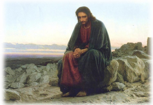
Christ in the Wilderness by Ivan Kramskoi

One does not live by bread alone, but by every word that comes forth from the mouth of God.