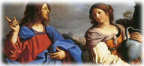
Guercino, 1641, Jesus and the Samaritan Woman at the Well , Thyssen Bornemisza Museum, Madrid Spain