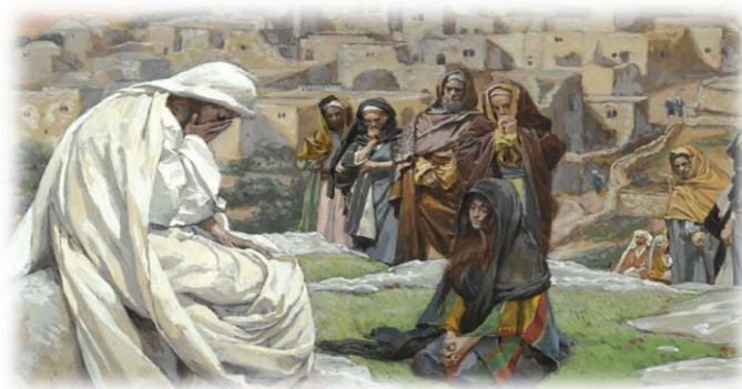
James Tissot, 1886 -1896, Jesus Wept , France

Everyone who lives and believes in me will not die for ever, says the Lord.