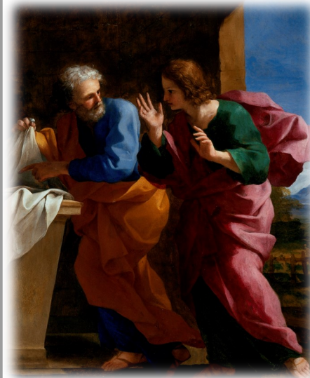
Romanelli. G. F., 1640, St John and St Peter at Christ's Tomb

So Peter set out with the other disciple to go to the tomb. They ran together, but the other disciple, running faster than Peter, reached the tomb first; he bent down and saw the linen cloths lying on the ground, but did not go in. Simon Peter who was following now came up, went right into the tomb, saw the linen cloths on the ground, and also the cloth that had been over his head; this was not with the linen cloths but rolled up in a place by itself. Then the other disciple who had reached the tomb first also went in; he saw and he believed. Till this moment they had failed to understand the teaching of scripture, that he must rise from the dead.