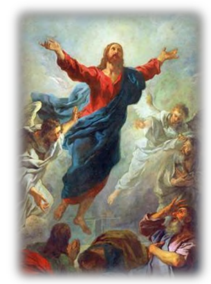
Jean Francois de Troy, C 1721, The Ascension , Musee des Beaux-Arts, Rouen, France

Jesus came up and spoke to them. He said, 'All authority in heaven and on earth has been given to me. Go, therefore, make disciples of all the nations; baptise them in the name of the Father and of the Son and of the Holy Spirit, and teach them to observe all the commandments I gave to you. And know that I am with you always; yes, to the end of time.'