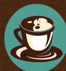
Hot + Iced Coffee